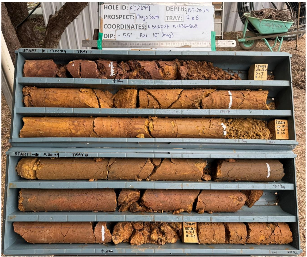
Figure 5: Photo of FI2679 PQ core – 15.7 to 20.5 metres (clay rich laterite)