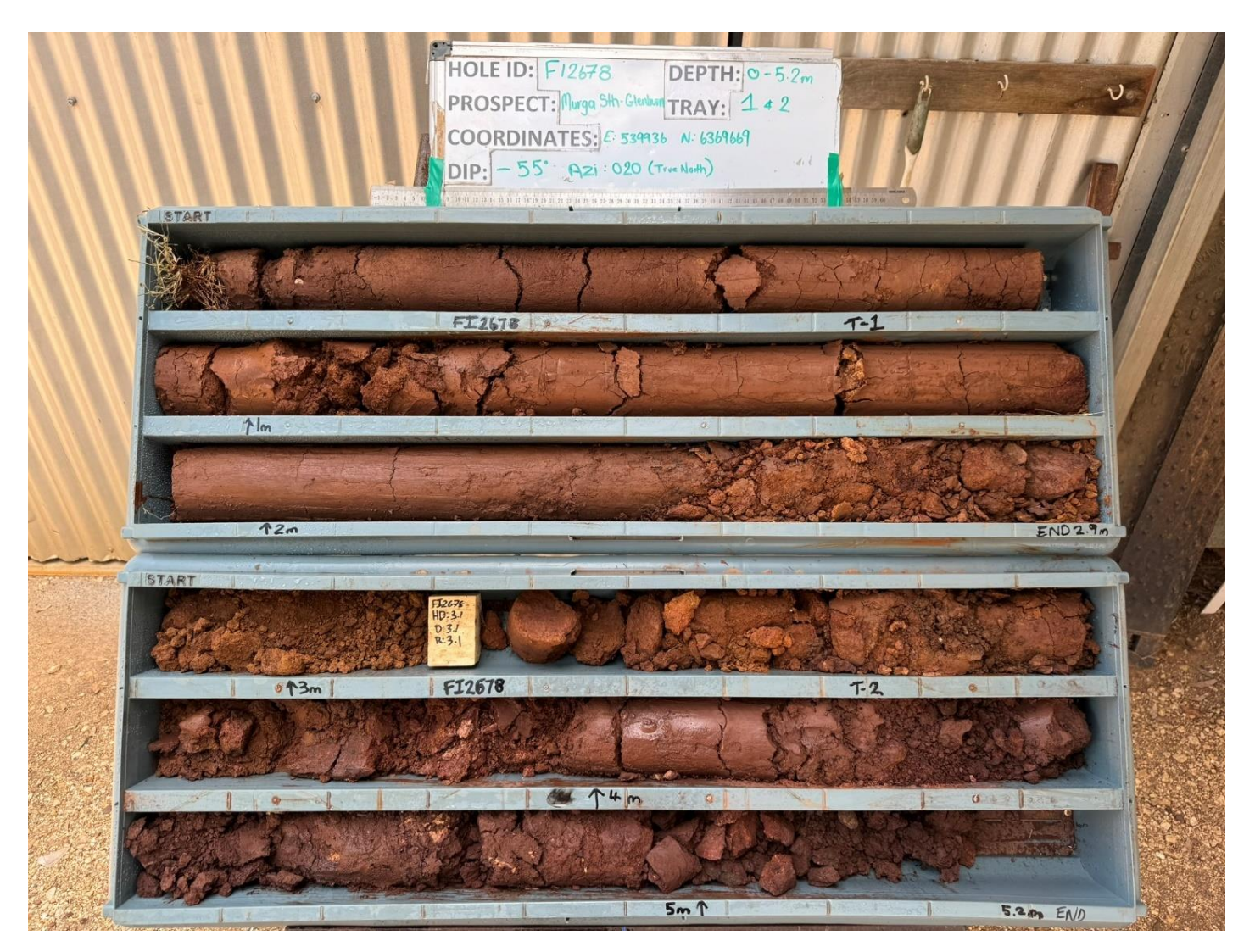
Figure 3: Photo of FI2678 PQ core – 0 to 5.2 metres (clay / laterite)