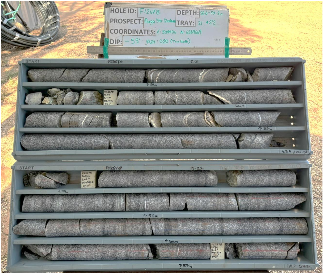
Figure 4: Photo of FI2678 HQ core - 50.6 to 57.3 metres (coarse grained pyroxenite)