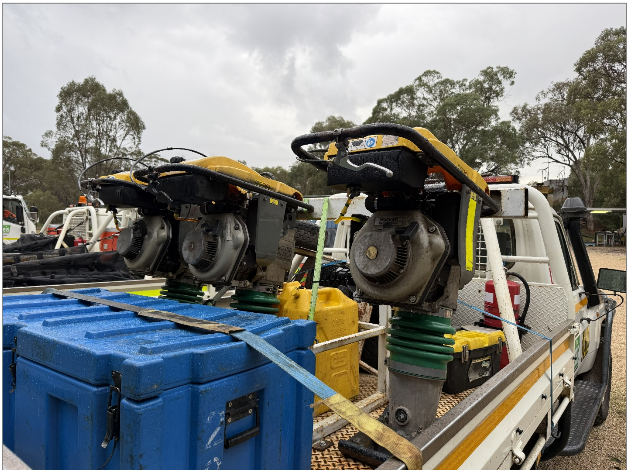
Figure 1: Velseis seismic crew vehicles and equipment.