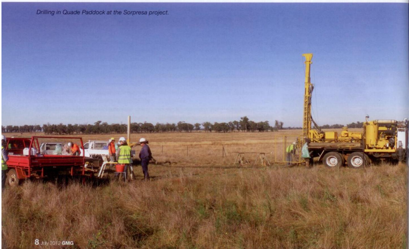
Drilling in Quade Paddock at the Sorpresa project.