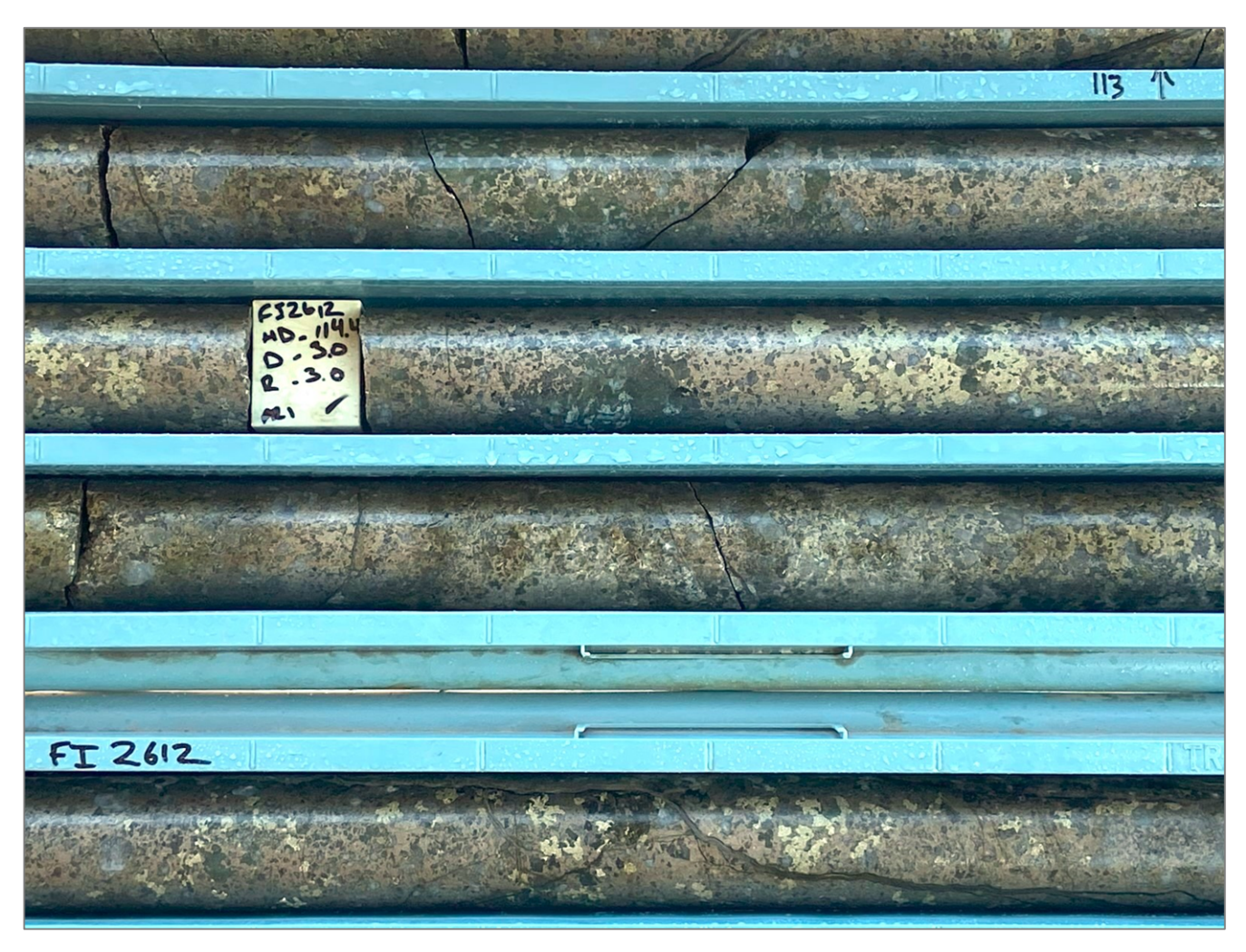
Figure 2: Detail of semi massive sulphides around 114.40 metres in FI2612 with location shown in Figure 1 above. Brown sulphides are pyrrhotite and pale-yellow sulphides are pyrite.

Rimfire Pacific Mining (ASX: RIM, "Rimfire" or "the Company") is pleased to advise that the first two diamond drill holes completed as part of a larger 6 hole (~1,000 metre) step out drilling program at the Bald Hill Cobalt Copper Prospect, have successfully intersected multiple broad zones (downhole widths) of sulphide mineralisation 100 – 200m away from previous high-grade cobalt drill intercepts.