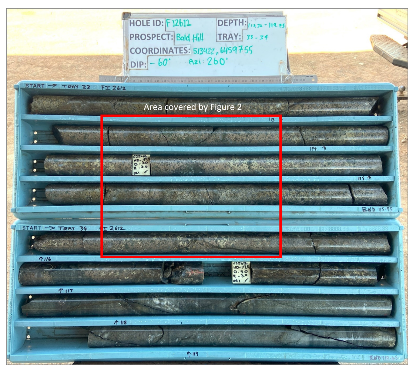
Figure 1: FI2612 diamond (NQ) drill core from 112.32 to 119.45 metres showing semimassive sulphides from 112.32 metres to 117.40 metres. The location of Figure 2 is shown by the red square.