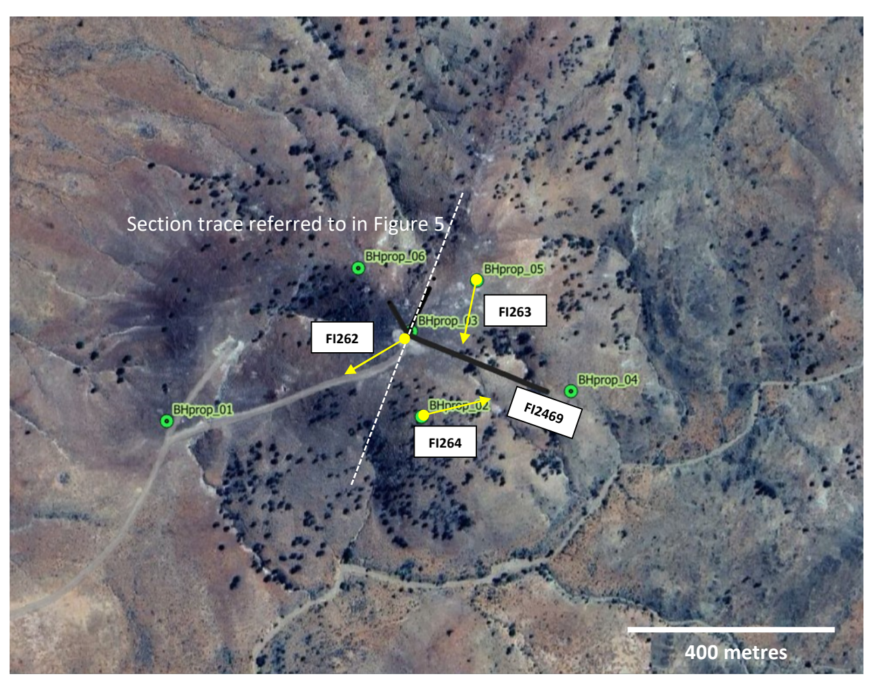
Figure 4: Bald Hill Prospect – ground magnetics image showing existing drill holes and newly identified magnetic body. Section trace referred to in Figure 5 shown in white.